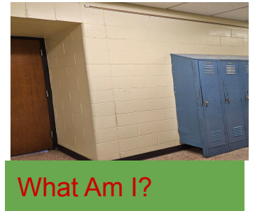
What Am I?