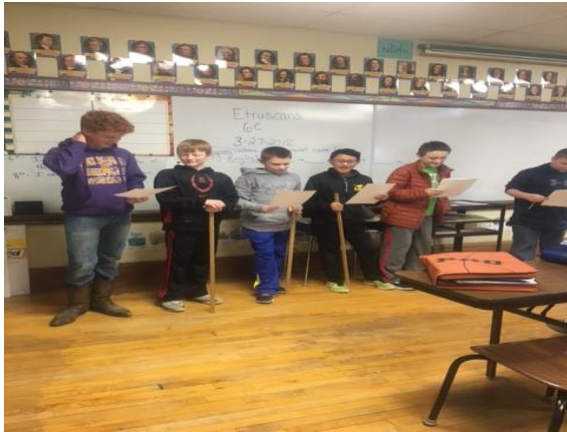
Plays about Social Studies lessons

East Marshall Middle School has been using the Mustang STRONG as a foundation while implementing PBIS (Positive Behavior Interventions and Supports). STRONG focuses on Safety, Teamwork, Respect, Opportunity, No Excuses, and Goal Oriented. The staff at the middle school acknowledge when students are showing these traits by giving the students a ticket. Tickets can be used to purchase items from the school store. There is a weekly drawing that allows for the opportunity to win items also. PBIS has been recognized during assemblies to encourage and recognize student achievements. Below are pictures of 6 th grade students promoting STRONG as they work with peers in groups. The PBIS team will continue training to assist with the implementation of PBIS for the 2018-2019 school year.