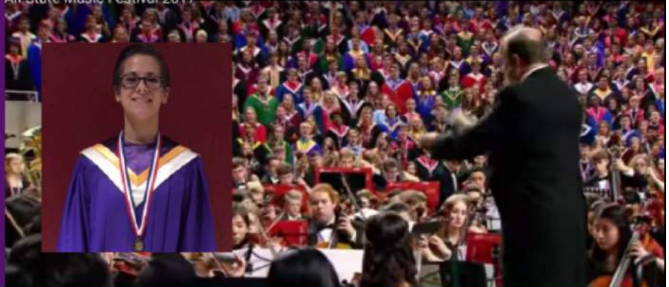
All-State Music Festival 2017